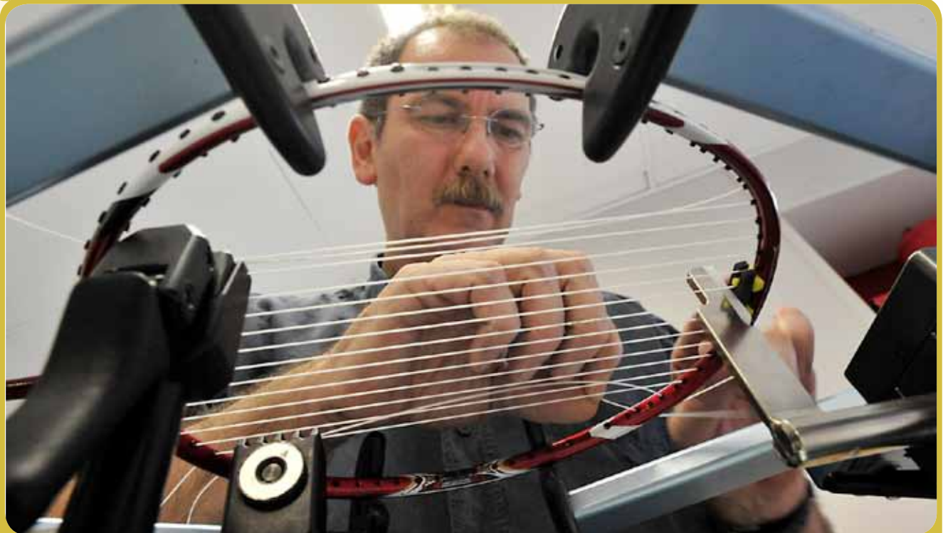
More complicated than the crochet, the art of strings. An hard exercise.