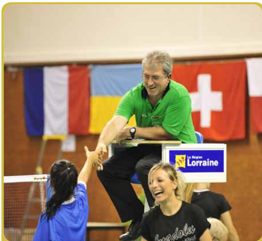
University atmosphere: between friendship and high-level sport.