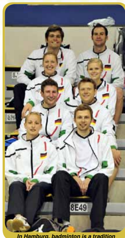
In Hamburg, badminton is a tradition

The University of Hamburg, attending the European Championship for the fourth time is a strong leader in the European badminton. Situated in the North of the country near the Elb and close to the North Sea, Hamburg is the second biggest city of Germany (after Berlin). Famous for its port, the city counts 1.8 millions inhabitants, and 3.5 millions in the Greater Hamburg. Spread apart in different spots in the city, the university welcomes 40 000 students. This is the fifth biggest in Germany. In its core, all the disciplines are mixed together,