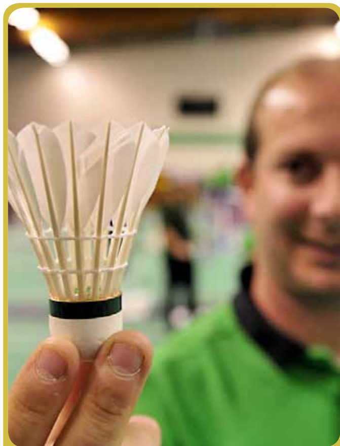
An average number of five shuttles are used during a match