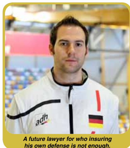
A future lawyer for who insuring his own defense is not enough.

The other big centre is located in Saarbrücken. These are our biggest rivals!" An enemy that took its revenge during the championship in Nancy. In the quarter final, the University of Sarre got the better of Hamburg during an intense match (3-2). A dead stop for the "Hamburgers" but probably not the end. "For several years, we've been here". Generations go on, players change, but the team spirit remains and this is essential." Auf Wiedersehen Hamburg and see you in Thessalonique in 2011!